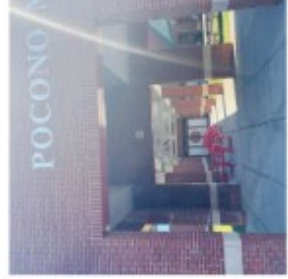
Students/Staff Entrance (Cafeteria)

Guests may enter through the Gymnasium/Auditorium Entrance. MCTI Seniors and Staff must enter through the Cafeteria Entrance.