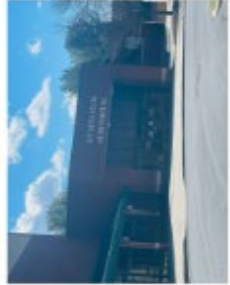
Guests Entrance (Gym/Auditorium)